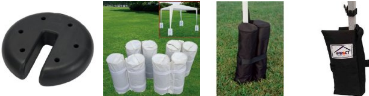
Example of approved canopy weights